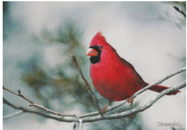
Sunday, January 14, 2018, 1PM-5PM

Please bring oil brushes and regular Oil painting supplies.