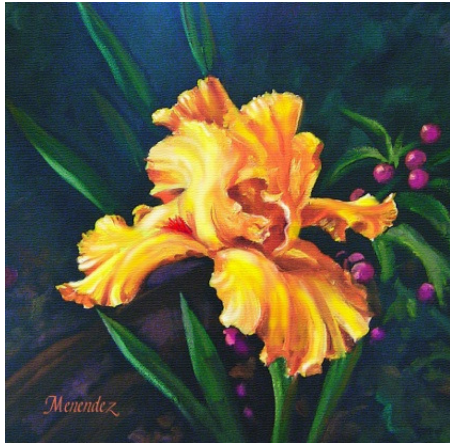
Saturday, January 13, 2018, 9:30AM-5PM