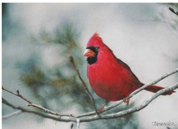
Sunday, January 14, 2018, 1PM-5PM

Please bring oil brushes and regular Oil painting supplies.